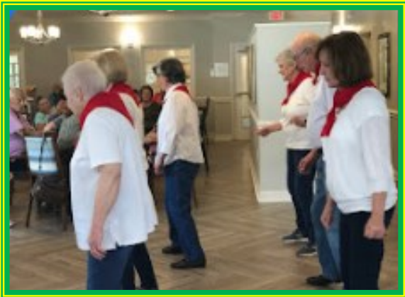
“The Carolina Line Dancers” placed 2nd in the “Performing Arts” category of the SilverArts.